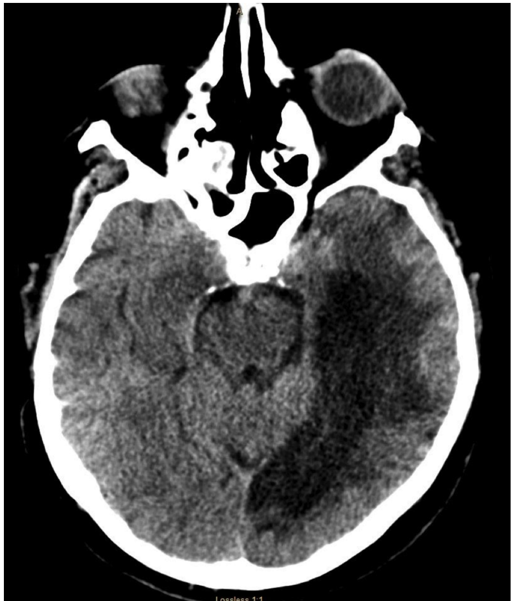
FIGURE 2: CT scan of the head that shows no acute changes. There is an area of hypodensity in the right temporal region, consistent with patient know prior history of left PCA embolic stroke